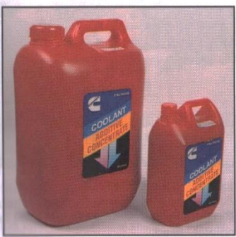
Il is supplied in plastic red colour containers having different part nos. for different volumes. The colour of the coolant additive concentrate is deep purple.